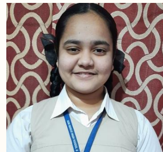
JIYA GAWAD IX A

Peace brings Joy, Prosperity, Harmony and Happiness. War can only bring destruction. Let us all live in peace and make this planet a better place.